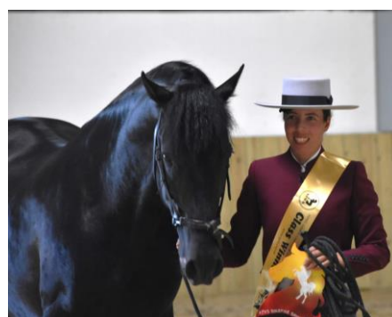
Photos from the 2023 APHS Solstice Show